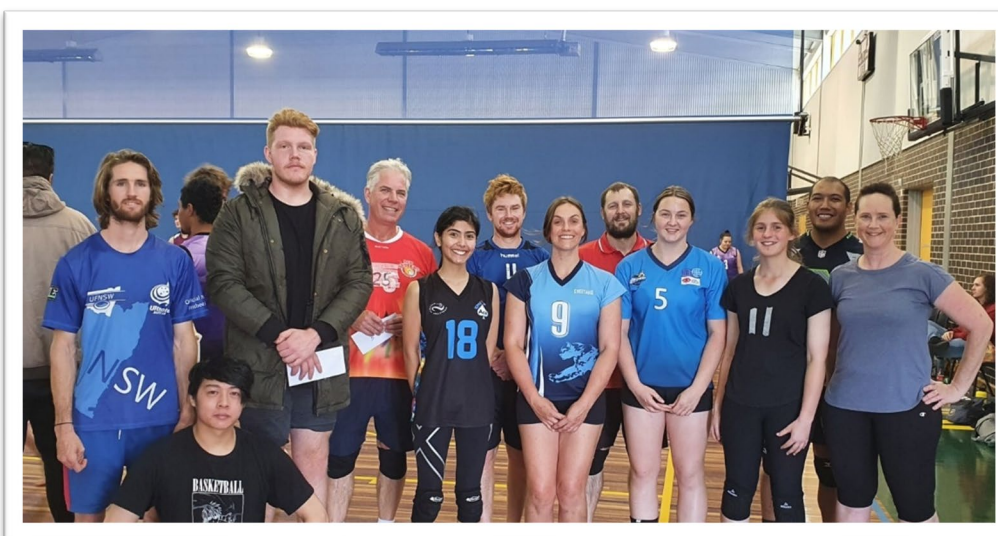
Red Setters & Nishhoku