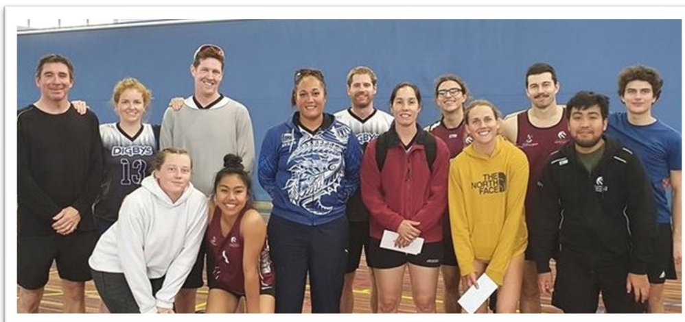
Spice Girls & Becky's Bouncers

Plans for 2021 include hosting multiple social tournaments aimed at fostering regional playing networks.